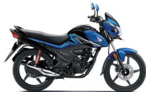
ATHLETIC BLUE METALLIC