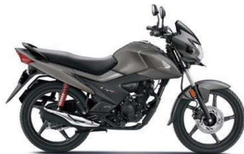
MATT CRUST METALLIC